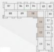
LEVEL 2 TO 14