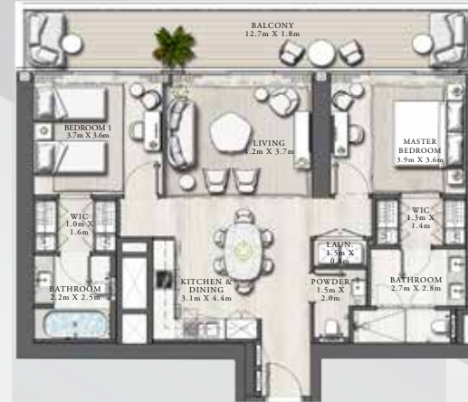
KEY PLAN LEVEL